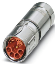
Figure shows standard item with data element

Please be informed that the data shown in this PDF document is generated from our online catalog. Please find the complete data in the user documentation. Our general terms of use for downloads are valid.