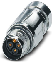
The figure shows the 4-pos. (3+PE) product version

Please be informed that the data shown in this PDF document is generated from our online catalog. Please find the complete data in the user documentation. Our general terms of use for downloads are valid.