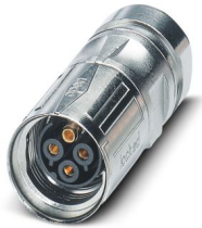
The figure shows the 4-pos. (3+PE) product version

Please be informed that the data shown in this PDF document is generated from our online catalog. Please find the complete data in the user documentation. Our general terms of use for downloads are valid.