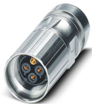
The figure shows the 4-pos. (3+PE) product version

Please be informed that the data shown in this PDF document is generated from our online catalog. Please find the complete data in the user documentation. Our general terms of use for downloads are valid.