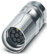
The figure shows the 4-pos. (3+PE) product version

Please be informed that the data shown in this PDF document is generated from our online catalog. Please find the complete data in the user documentation. Our general terms of use for downloads are valid.