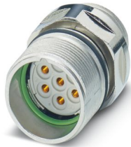
The figure shows the 6-pos. product version

Please be informed that the data shown in this PDF document is generated from our online catalog. Please find the complete data in the user documentation. Our general terms of use for downloads are valid.