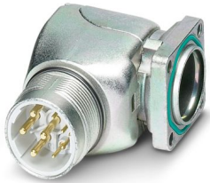
The figure shows the 8-pos. (4+3+PE) product version

Please be informed that the data shown in this PDF document is generated from our online catalog. Please find the complete data in the user documentation. Our general terms of use for downloads are valid.