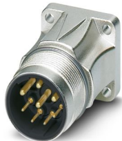
The figure shows the 8-pos. (4+3+PE) product version

Please be informed that the data shown in this PDF document is generated from our online catalog. Please find the complete data in the user documentation. Our general terms of use for downloads are valid.