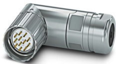
The figure shows the product version with solder contacts

Please be informed that the data shown in this PDF document is generated from our online catalog. Please find the complete data in the user documentation. Our general terms of use for downloads are valid.