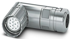
The figure shows the 12-pos. product version

Please be informed that the data shown in this PDF document is generated from our online catalog. Please find the complete data in the user documentation. Our general terms of use for downloads are valid.