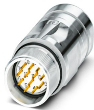
The figure shows the product version with solder contacts

Please be informed that the data shown in this PDF document is generated from our online catalog. Please find the complete data in the user documentation. Our general terms of use for downloads are valid.