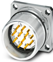
The figure shows the product version with solder contacts

Please be informed that the data shown in this PDF document is generated from our online catalog. Please find the complete data in the user documentation. Our general terms of use for downloads are valid.