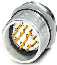
The figure shows the product version with solder contacts

Please be informed that the data shown in this PDF document is generated from our online catalog. Please find the complete data in the user documentation. Our general terms of use for downloads are valid.