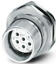
The figure shows the 6-pos. product version

Please be informed that the data shown in this PDF document is generated from our online catalog. Please find the complete data in the user documentation. Our general terms of use for downloads are valid.