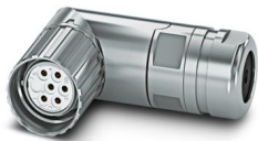
The figure shows the 6-pos. product version

Please be informed that the data shown in this PDF document is generated from our online catalog. Please find the complete data in the user documentation. Our general terms of use for downloads are valid.