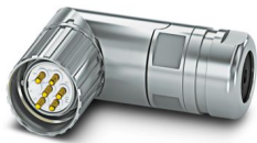
The figure shows the 6-pos. product version

Please be informed that the data shown in this PDF document is generated from our online catalog. Please find the complete data in the user documentation. Our general terms of use for downloads are valid.