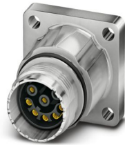
The figure shows the 8-pos. product version

Please be informed that the data shown in this PDF document is generated from our online catalog. Please find the complete data in the user documentation. Our general terms of use for downloads are valid.