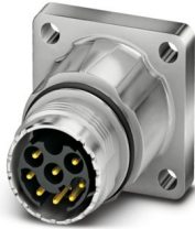
The figure shows the 8-pos. product version

Please be informed that the data shown in this PDF document is generated from our online catalog. Please find the complete data in the user documentation. Our general terms of use for downloads are valid.