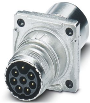
The figure shows the 8-position version.

Please be informed that the data shown in this PDF document is generated from our online catalog. Please find the complete data in the user documentation. Our general terms of use for downloads are valid.