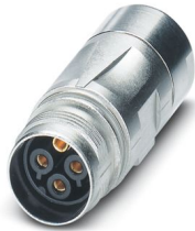
The figure shows the 4-position version

Please be informed that the data shown in this PDF document is generated from our online catalog. Please find the complete data in the user documentation. Our general terms of use for downloads are valid.