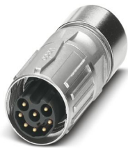
The figure shows the 8-pos. product version

Please be informed that the data shown in this PDF document is generated from our online catalog. Please find the complete data in the user documentation. Our general terms of use for downloads are valid.