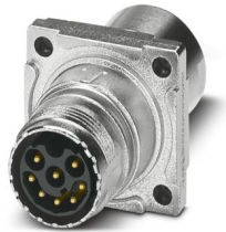
The figure shows the 8-pos. product version

Please be informed that the data shown in this PDF document is generated from our online catalog. Please find the complete data in the user documentation. Our general terms of use for downloads are valid.