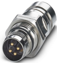
The figure shows the 4-pos. (3+PE) product version

Please be informed that the data shown in this PDF document is generated from our online catalog. Please find the complete data in the user documentation. Our general terms of use for downloads are valid.