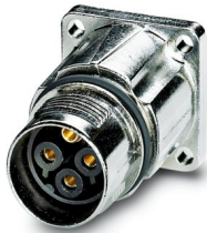
The figure shows the 4-pos. (3+PE) product version

Please be informed that the data shown in this PDF document is generated from our online catalog. Please find the complete data in the user documentation. Our general terms of use for downloads are valid.