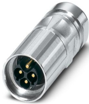
The figure shows the 4-pos. (3+PE) product version

Please be informed that the data shown in this PDF document is generated from our online catalog. Please find the complete data in the user documentation. Our general terms of use for downloads are valid.