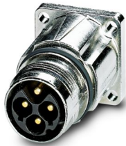
The figure shows the 4-pos. (3+PE) product version

Please be informed that the data shown in this PDF document is generated from our online catalog. Please find the complete data in the user documentation. Our general terms of use for downloads are valid.