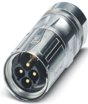
The figure shows the 4-pos. (3+PE) product version

Please be informed that the data shown in this PDF document is generated from our online catalog. Please find the complete data in the user documentation. Our general terms of use for downloads are valid.