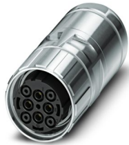
The figure shows the 8-pos. (4+3+PE) product version

Please be informed that the data shown in this PDF document is generated from our online catalog. Please find the complete data in the user documentation. Our general terms of use for downloads are valid.