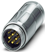
The figure shows the 8-pos. (4+3+PE) product version

Please be informed that the data shown in this PDF document is generated from our online catalog. Please find the complete data in the user documentation. Our general terms of use for downloads are valid.