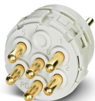
The figure shows the 6-pos. product version

Please be informed that the data shown in this PDF document is generated from our online catalog. Please find the complete data in the user documentation. Our general terms of use for downloads are valid.