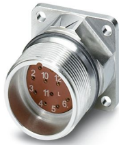
The figure shows the 12-pos. product version

Please be informed that the data shown in this PDF document is generated from our online catalog. Please find the complete data in the user documentation. Our general terms of use for downloads are valid.