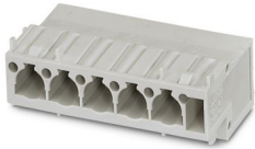
The figure shows the product version VC-AML 5

Contact insert, Range of articles: VARIOCON, design: VC3, color: light gray, number of positions: 5, rated voltage: 690, rated current: 63 A, Connection method: PCB connection, Connectors may only be connected/disconnected when under no load.