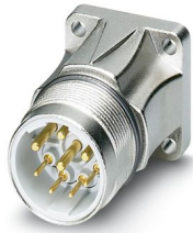
The figure shows the 8-pos. (4+3+PE) product version

Please be informed that the data shown in this PDF document is generated from our online catalog. Please find the complete data in the user documentation. Our general terms of use for downloads are valid.