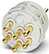
The figure shows the 6-pos. product version

Please be informed that the data shown in this PDF document is generated from our online catalog. Please find the complete data in the user documentation. Our general terms of use for downloads are valid.