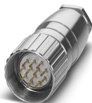
The figure shows the 12-pos. product version

Please be informed that the data shown in this PDF document is generated from our online catalog. Please find the complete data in the user documentation. Our general terms of use for downloads are valid.