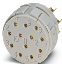
The figure shows the 12-pos. product version

Please be informed that the data shown in this PDF document is generated from our online catalog. Please find the complete data in the user documentation. Our general terms of use for downloads are valid.