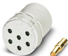
The figure shows the 6-pos. product version

Please be informed that the data shown in this PDF document is generated from our online catalog. Please find the complete data in the user documentation. Our general terms of use for downloads are valid.