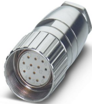
The figure shows the 12-pos. product version, with standard DIN cable gland

Please be informed that the data shown in this PDF document is generated from our online catalog. Please find the complete data in the user documentation. Our general terms of use for downloads are valid.