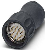
The figure shows the 12-pos. product version

Please be informed that the data shown in this PDF document is generated from our online catalog. Please find the complete data in the user documentation. Our general terms of use for downloads are valid.