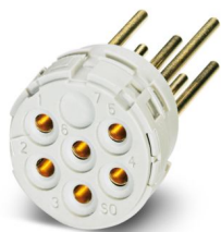
The figure shows the 6-pos. product version

Please be informed that the data shown in this PDF document is generated from our online catalog. Please find the complete data in the user documentation. Our general terms of use for downloads are valid.