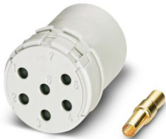
The figure shows the 6-pos. product version

Please be informed that the data shown in this PDF document is generated from our online catalog. Please find the complete data in the user documentation. Our general terms of use for downloads are valid.