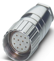
The figure shows the 12-pos. product version

Please be informed that the data shown in this PDF document is generated from our online catalog. Please find the complete data in the user documentation. Our general terms of use for downloads are valid.