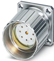
The figure shows the 9-pos. product version

Please be informed that the data shown in this PDF document is generated from our online catalog. Please find the complete data in the user documentation. Our general terms of use for downloads are valid.