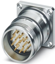
The figure shows the 17-pos. product version with O-ring seal

Please be informed that the data shown in this PDF document is generated from our online catalog. Please find the complete data in the user documentation. Our general terms of use for downloads are valid.