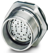
The figure shows the 28-pos. product version

Please be informed that the data shown in this PDF document is generated from our online catalog. Please find the complete data in the user documentation. Our general terms of use for downloads are valid.