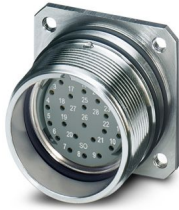
The figure shows the 28-pos. product version

Please be informed that the data shown in this PDF document is generated from our online catalog. Please find the complete data in the user documentation. Our general terms of use for downloads are valid.