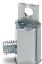
HC-K6 PE clamp 6 - 16 with threaded pin M6 x 12 DIN 913 for socket

Please be informed that the data shown in this PDF document is generated from our online catalog. Please find the complete data in the user documentation. Our general terms of use for downloads are valid.