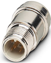
Sensor/actuator flush-type plug, 4-pos., M12, A-coded, front/press-in mounting, with straight solder connection

Please be informed that the data shown in this PDF document is generated from our online catalog. Please find the complete data in the user documentation. Our general terms of use for downloads are valid.