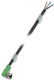
The figure shows the standard type

Please be informed that the data shown in this PDF document is generated from our online catalog. Please find the complete data in the user documentation. Our general terms of use for downloads are valid.