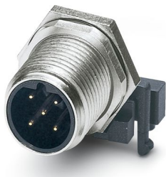
Device connector rear mounting, 5-position, Pin, angled, M12, B-coding, Wave soldering

Please be informed that the data shown in this PDF document is generated from our online catalog. Please find the complete data in the user documentation. Our general terms of use for downloads are valid.